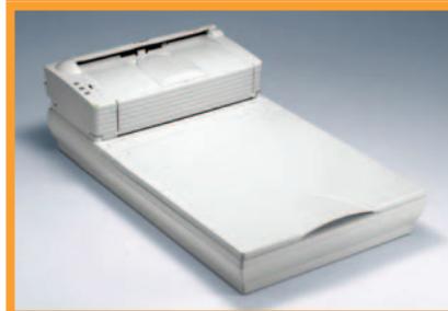
DR-2580C with optional Flatbed Scanner

Compact, powerful, and fast. The DR-2580C is a versatile scanner designed to meet the diverse imaging needs of your busy office. This innovative machine offers you the most advanced features in document scanning. Better yet, it comes bundled with the latest version of CapturePerfect and Adobe Acrobat, so it's easy to use right out of the box. Most important, it's from Canon, the brand the world relies on for the latest solutions in imaging technology.